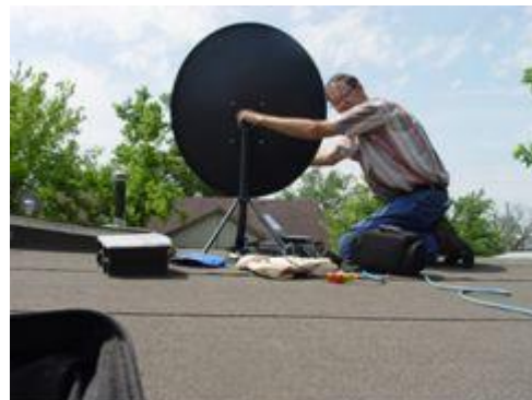
Gene on the roof getting 3ABN tuned in.