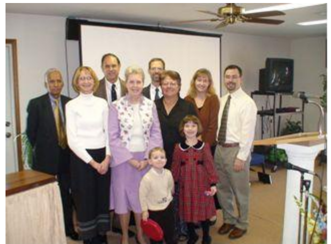
The Food Basket distribution team.

One family sent a thank you note saying the basket was the best they had ever received. Seeds were planted a plenty that day! A few families that we had helped in 2006 were again in need of assistance and we were blessed to be able to provide for them again. We pray that God will bless them so that they will have all of their needs supplied through this year. Those who helped delivering the baskets received a great blessing. A big thank you to those who took their time to come and share God's love with others during the distribution!